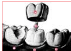
Provided in the interest of your good dental health by Western Dental Plan.

If cosmetics are of concern white porcelain is baked onto the crown surface.